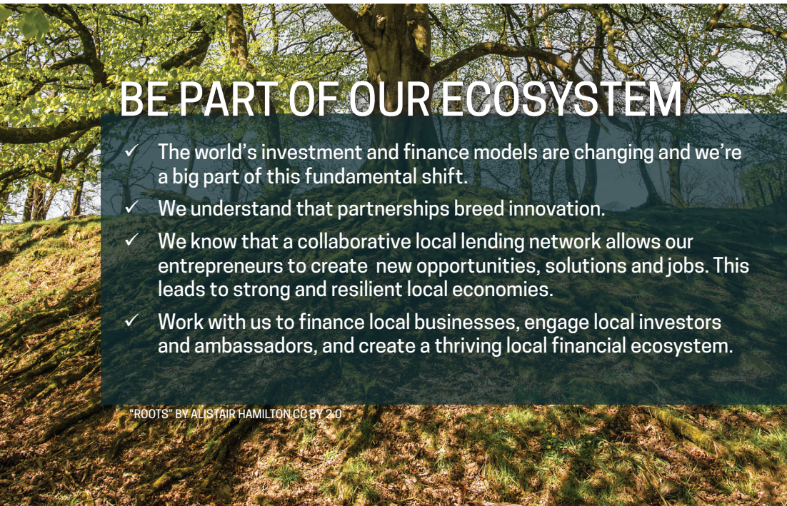
"ROOTS" BY ALISTAIR HAMILTON CC BY 2.0

BUILDING CAPITAL & CAPACITY IN OUR COMMUNITIES