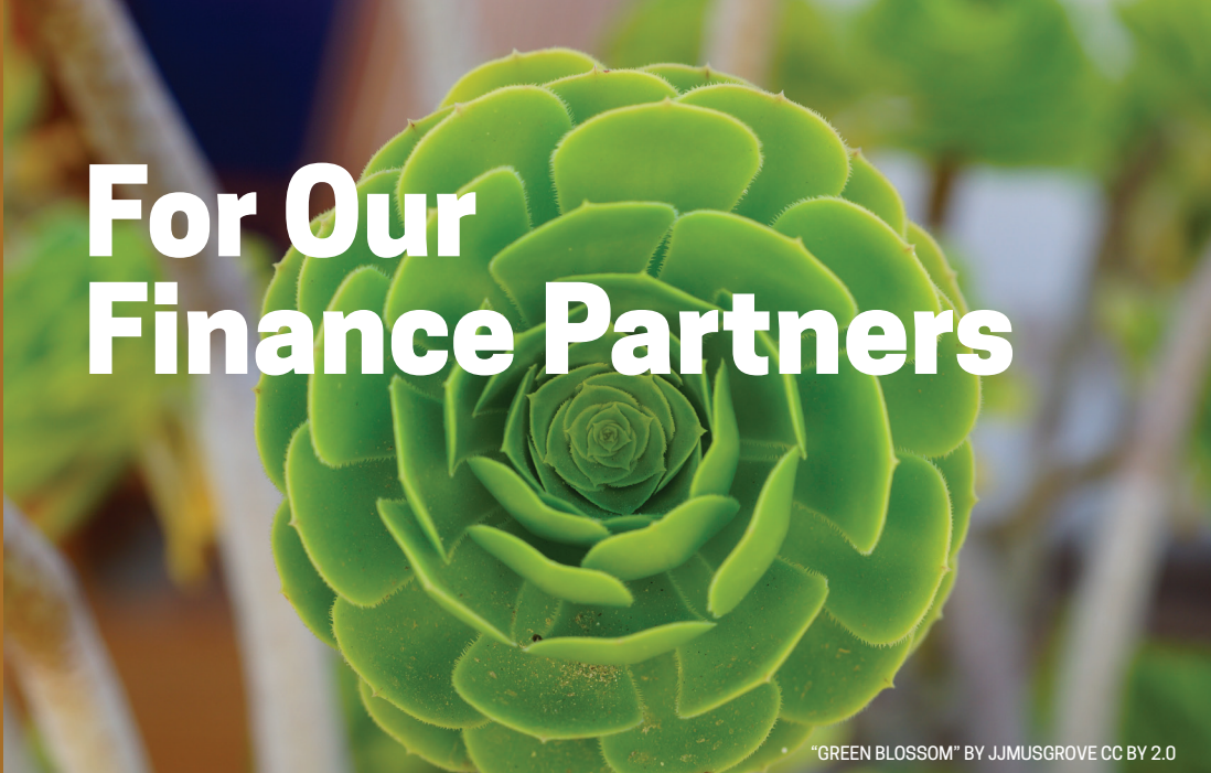
"GREEN BLOSSOM" BY JJMUSGROVE CC BY 2.0

Community Investment Co-ops allow residents and organizations to invest where they live, work and play